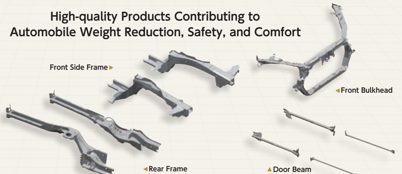
◀ Rear Frame