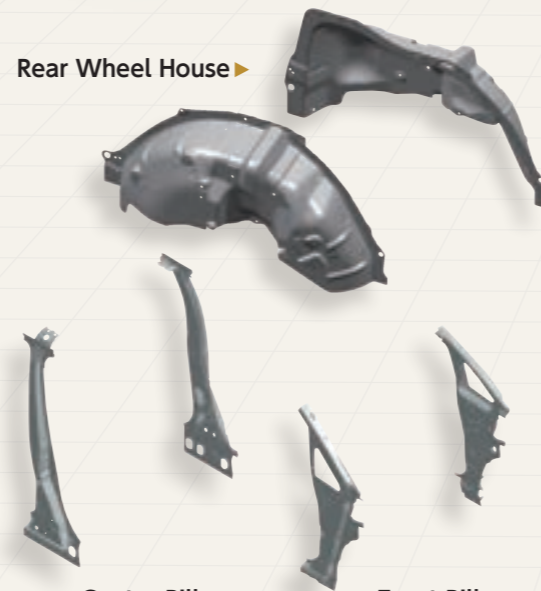
▲ Center Pillar